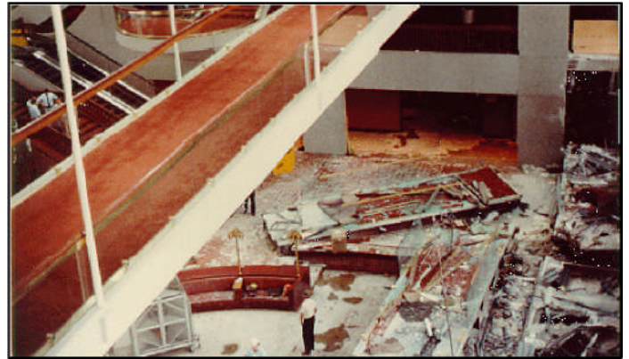
Figure 1: Pieces of the collapsed walkways in the atrium.

On July 17, 1981, nearly one year after its completion, the Hyatt Regency Hotel in Kansas City, Missouri filled its lobby with guests participating in and watching the evening “tea dance.” Suspended above the lobby were concrete walkways designed to connect both sides of the 2 nd , 3 rd , and 4 th floors. Shortly into the dance, two of the walkways, packed with spectators, collapsed onto the crowded atrium floor below (Figure 1). The event was triggered by a failure in the connection between a supporting rod and the box beam of the fourth floor walkway. This disaster killed 114 people and injured approximately 200 more, which at the time was the deadliest structural collapse in U.S. history.