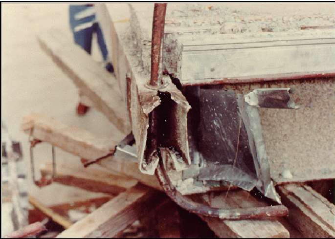
Figure 4: Ruptured box beam on the collapsed walkway.

G.C.E., the structural engineering design contractor, created only a partial design and left the most safety-critical design decisions to the fabrication/installation contractor, Havens Steel. Havens created the design without any documented engineering analysis and submitted it to G.C.E., who approved the design, without any documented engineering analysis either. NBS investigators were unable to find any significant recorded calculations of safety factors or yield strengths of the walkway connections. After weighing sections of the collapsed walkways, viewing footage of the crash, and re-creating sections of the walkways, NBS investigators determined that the load capacity on each connector was approximately only 60% of the Kansas City Building Code's required load capacity for that type of connection.